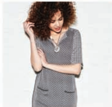
Stockists of Paul Green, Hogl, Sandwich, Oui, Noa Noa, InWear, Oilily & many more carefully selected brands