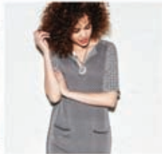
Stockists of Paul Green, Hogl, Sandwich, Oul, Noa Noa, InWear, Oilily & many more carefully selected brands