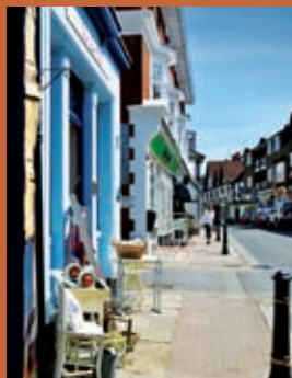
The High Street in glorious sunshine