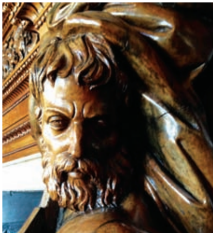
Restoration of an Apollo figure on an antique English walnut fireplace surround