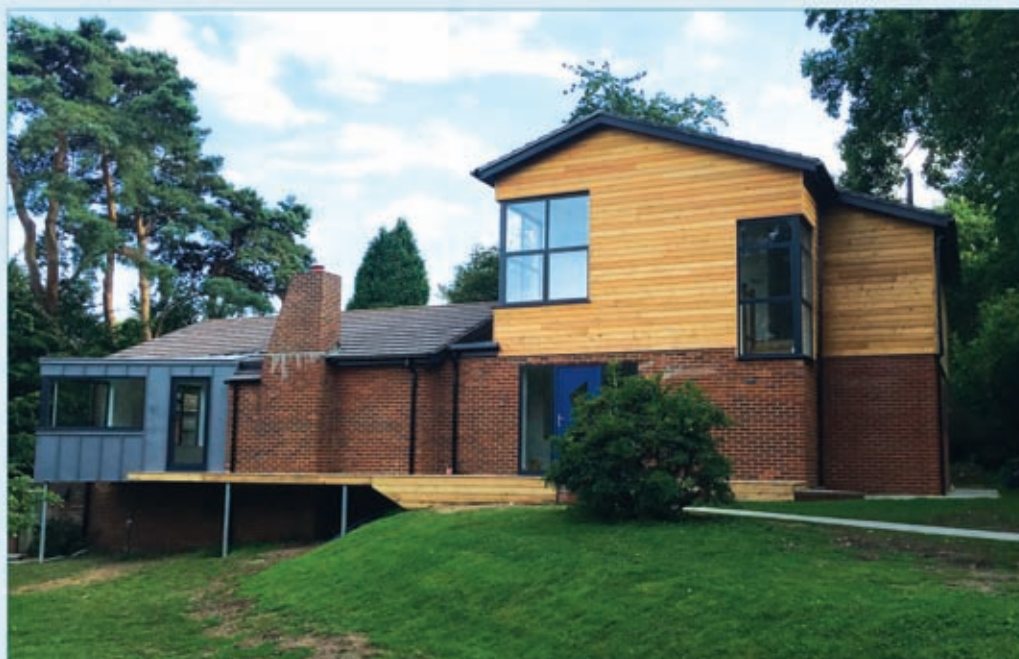
A recently completed project in Hurstpierpoint