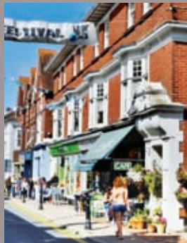
Jane Willis The busy High Street during Hurst Festival