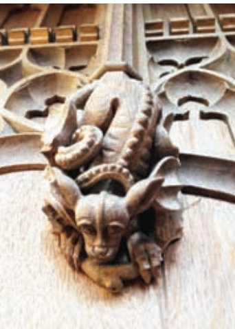
A unique hand-carved dragon from Oak

See more of Roy's work at: www.bespokewoodcarving.co.uk