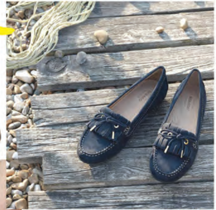
@BRADSHAW & LLOYD