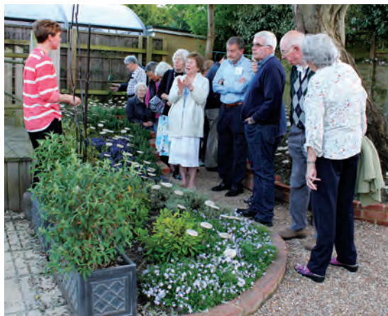
In St Lawrence School sensory garden

constructed the Sensory Garden at St. Lawrence School with a visit to the Garden itself. All were very rewarding evenings.