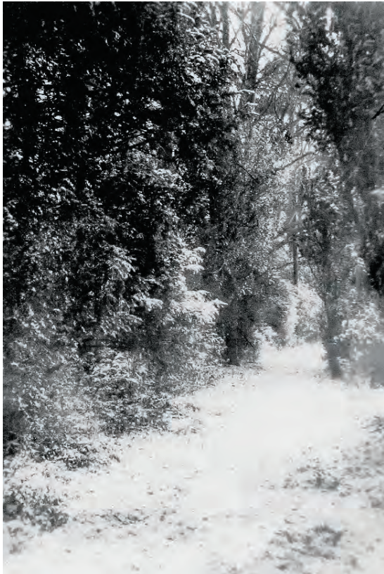
Mossy Mile walk circa 1955